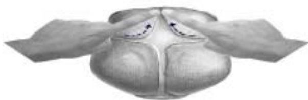
Figure 1. Method used to identify the corners of the fontanelle.

During vaginal delivery skull bones move towards each other to facilitate the delivery, resulting in moulding of the skull. Mild to moderate moulding settles by 24 to 48 hours after birth. Severe moulding indicated by overlapping skull bones may persist even few weeks [10, 11]. Babies born by uncomplicated normal vaginal deliveries are discharged from the hospital within 24 hours. Turning this into consideration and allowing maximum time for moulding to settle, fontanelle size was measured between 12 to 24 hours after the delivery. Babies with any degree of overriding skull bones by 24 hours were excluded from the study. With careful consideration to methods used in previous studies, following method was used to measure the fontanelle size. Two examiners examined each child. One examiner brought his index fingers along the anterior borders of the fontanelle. The meeting point of fingers was taken as the anterior corner of the fontanelle (Figure 1).